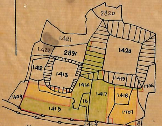
MOUZA NALHATI J.L.NO.53.